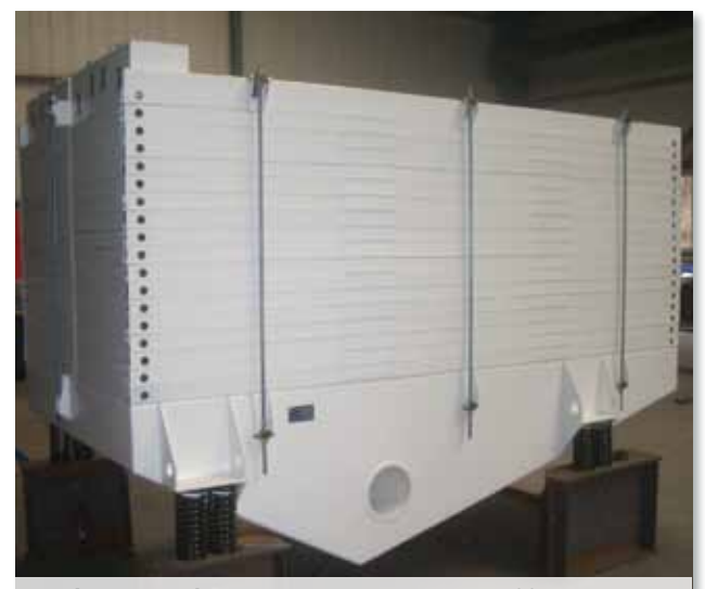
Production machine MHR 20/28/XVII (2 IIX) width 2000 mm, length 2800 mm with 17 decks in two screen units