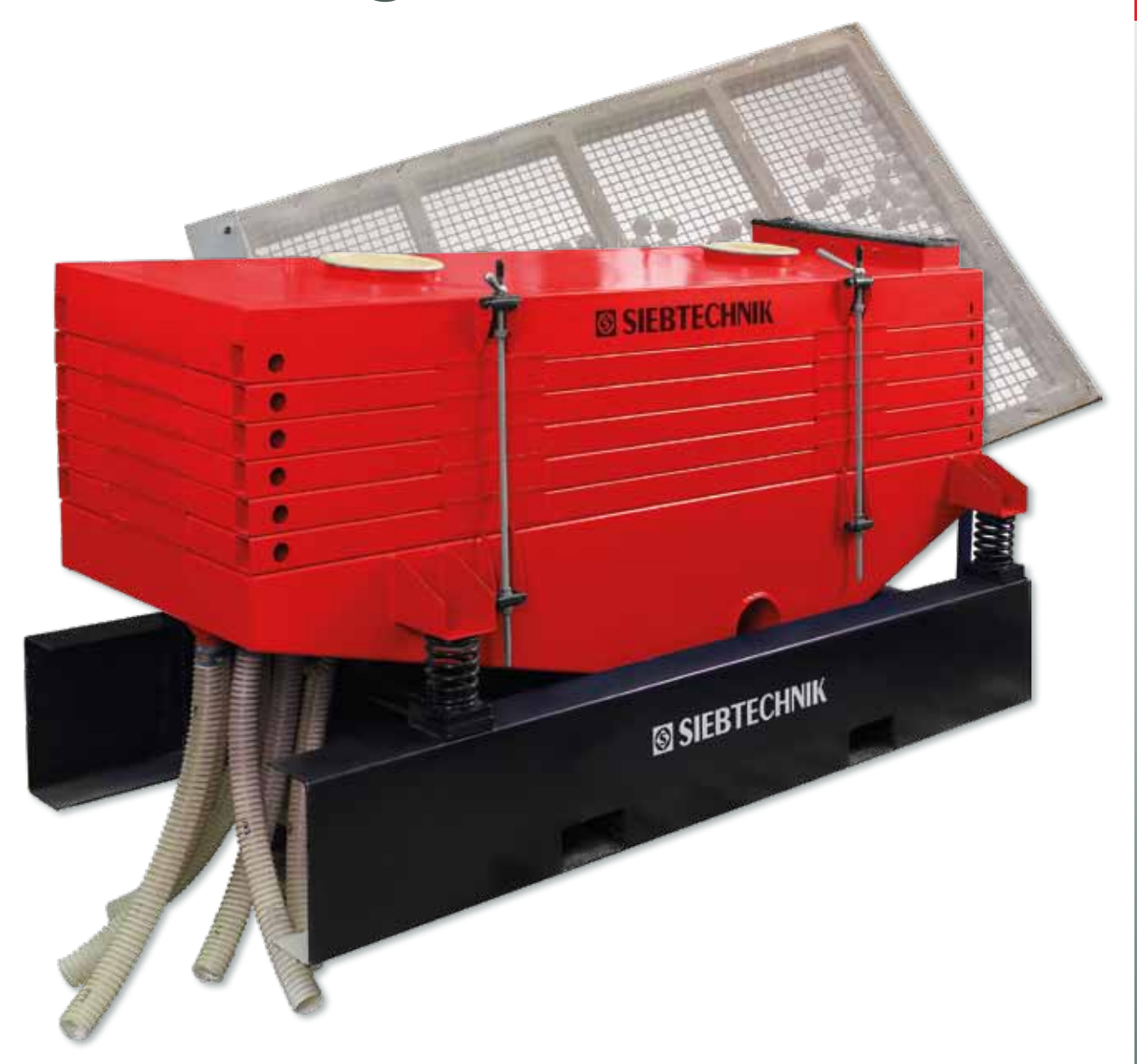
Series MHR The screening machine for fine particles